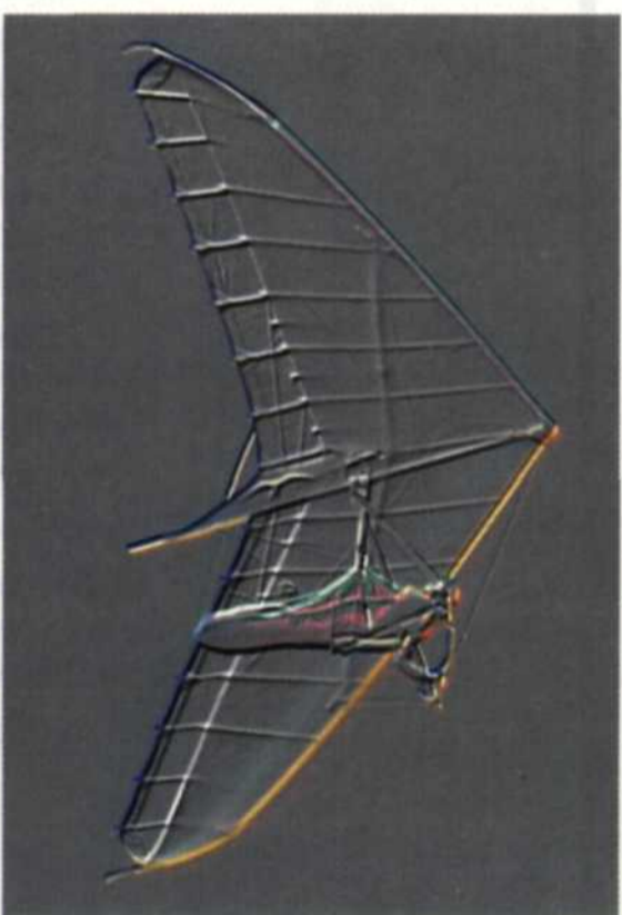
Special effects were applied to image using action commands and plug-in filters.