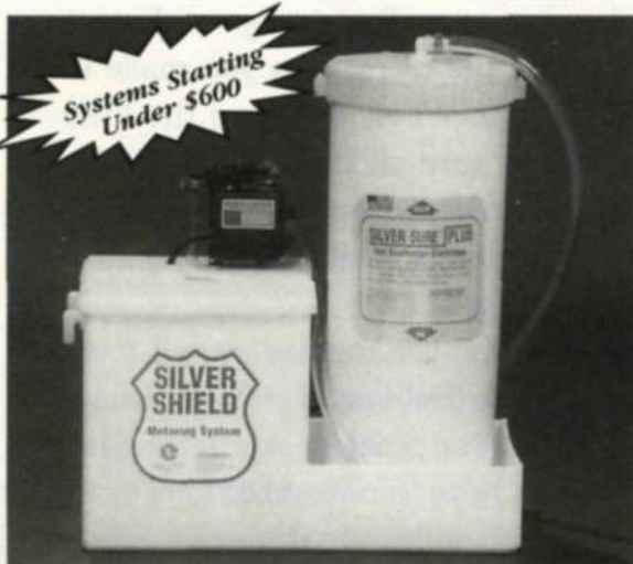
Silver Shield Model AG-501

When you load one of these new Actions, use the down arrows to open the Action and see what it does. It will list each step in plain English. If you like most of the Action but want to change one part, you can click on that line of instruction and change the val-